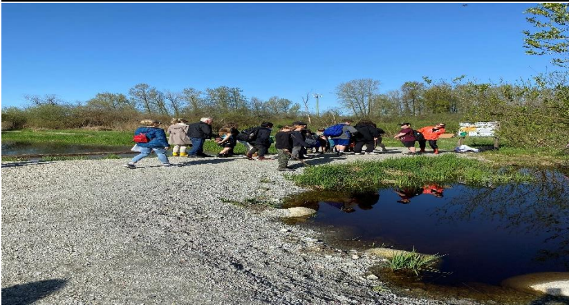
Streamkeepers at the Wetlands!